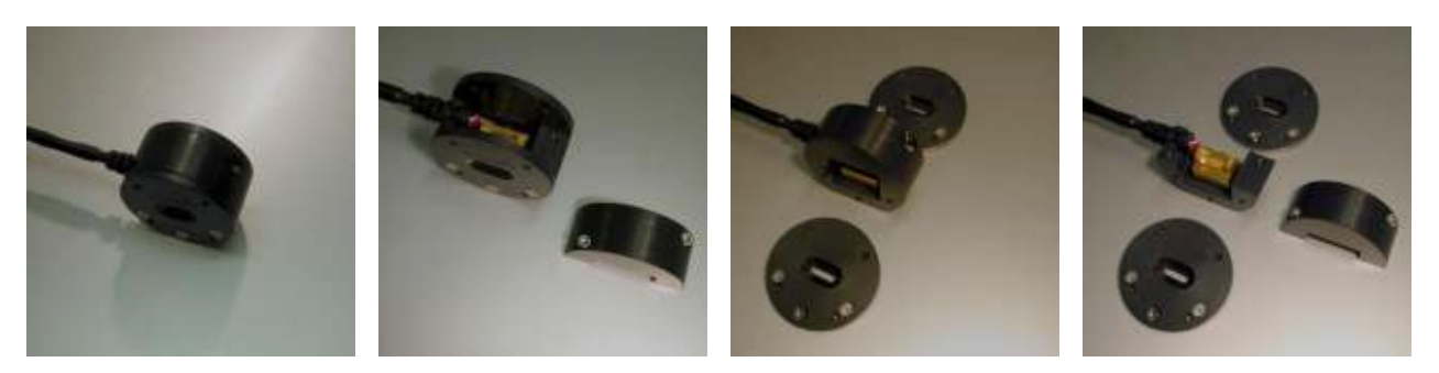
Figure 4. Oven configurations

The PPLN oven can be operated in a number of different configurations, which through the removal of insulation allows increased access to the PPLN crystal, however a decrease in oven efficiency and stability will occur. The oven can be operated without the oven top in place, this can be achieved by following the removal procedure outlined above. If greater access to the PPLN crystals optical facets is required, then the end plates of the oven can be removed. The end plate is removed by using a 1.5mm hex driver to take out the three retaining bolts. When replacing the end plates, a similar degree of care must be taken as is associated with the removal and replacement of the oven top, excessive force applied to the retaining bolts may result in damage to the oven.