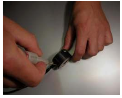
Figure 1. Oven top removal

Covesion's PPLN oven is designed for optimum operation of PPLN crystals at elevated temperatures, and also offers a convenient and accurate method of mounting and aligning optical crystals within an optical train.